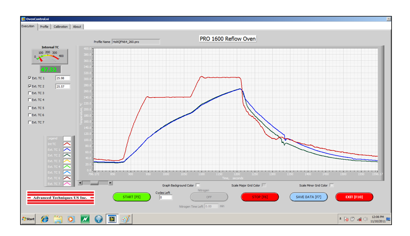
Figure 4: Reflow Cycle 2