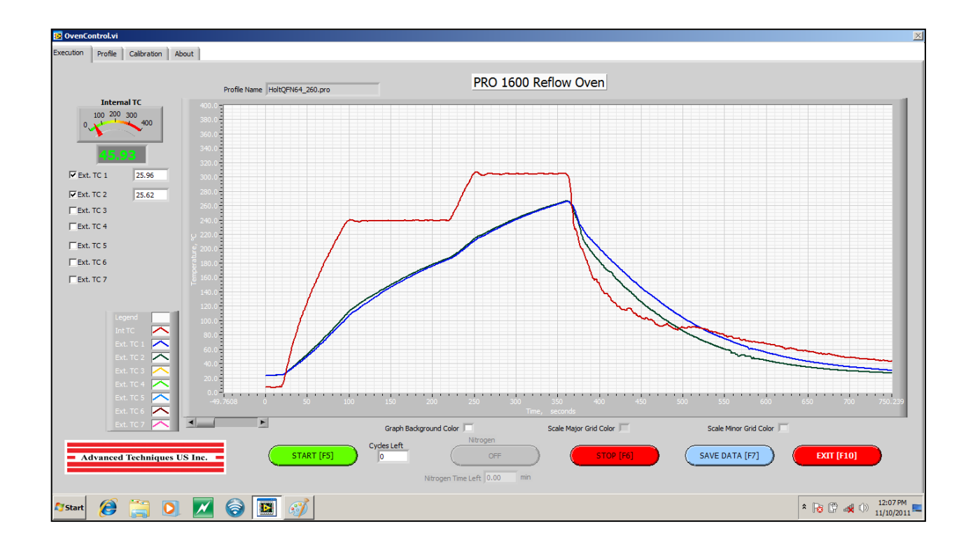
Figure 3: Reflow Cycle 1