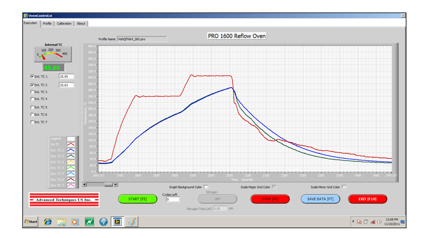
Figure 5: Reflow Cycle 3