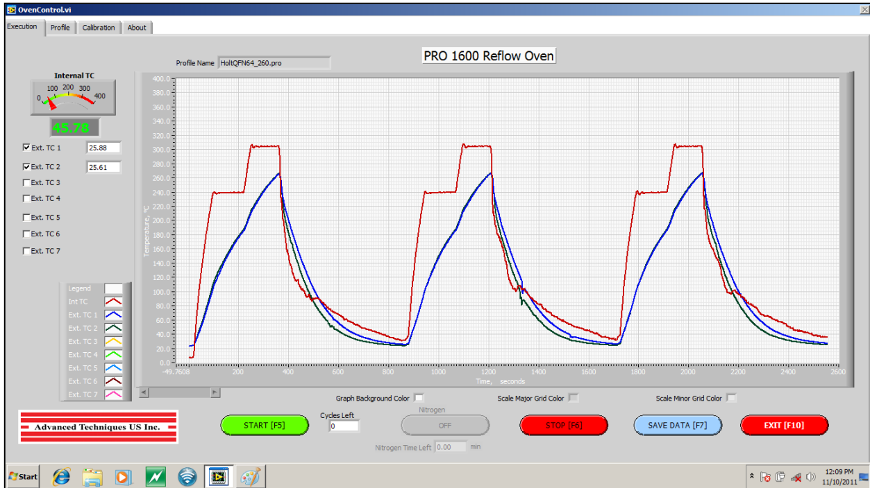
Figure 2: Software's Screenshot After Completion of 3 Solder Reflow Cycles

Once the SMD's have been placed inside the reflow simulator, an operator selects a preset profile within the software screen and clicks "Start" to begin reflow. Loading tray automatically moves inside the heating chamber and heating is initiated. From this point on, PRO 1600 RS would automatically cycle the parts 3 times without operator intervention. Data from each cycle is recorded into a raw data file as well as a graph on the software screen. Figure 2 below represents the oven's software generated graph of all 3 reflow cycles.