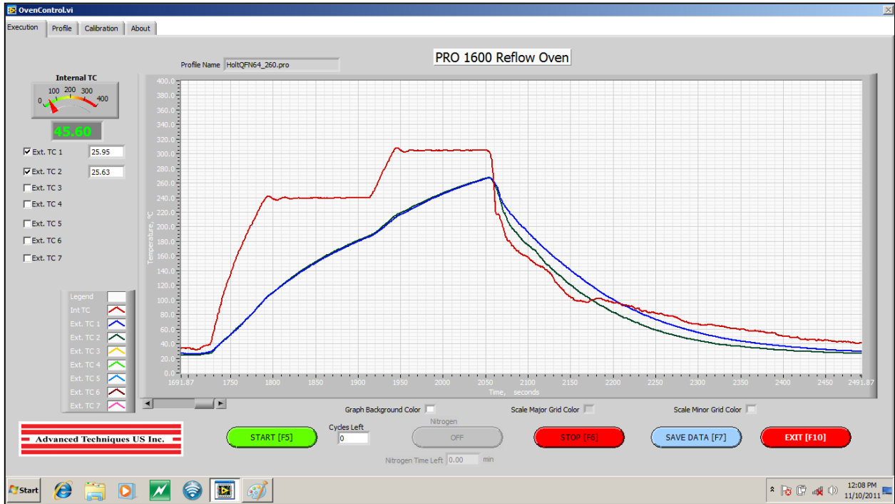
Figure 5: Reflow Cycle 3