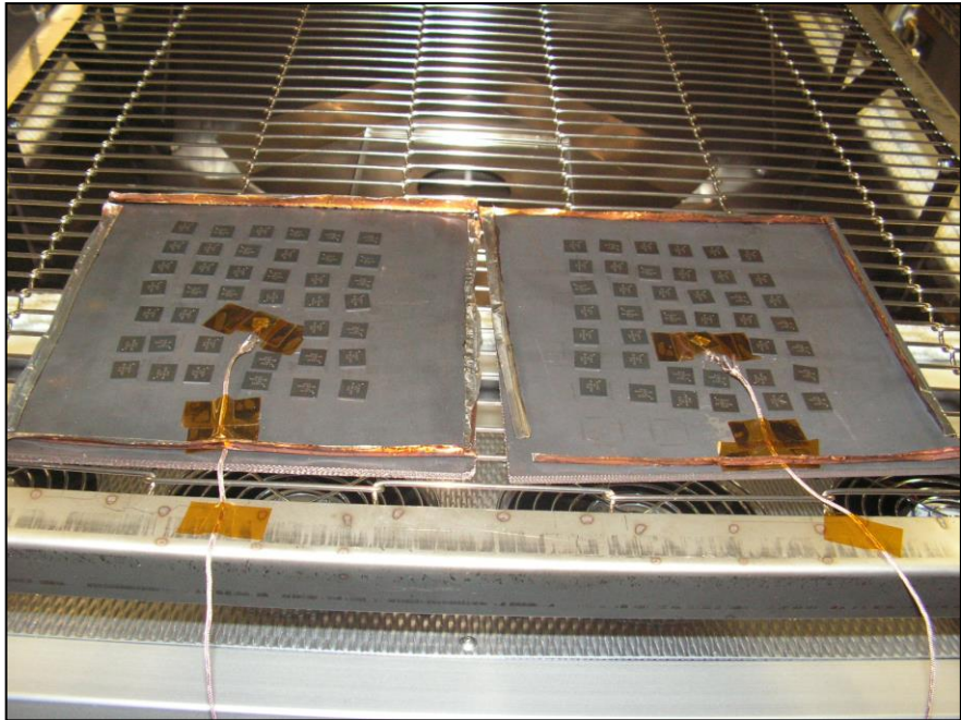
Figure 1: SMDs positioned on carriers inside the reflow simulator

A total of 80 QFN-64 SMDs were placed on 2 carriers (see Figure 1) in a live-bug orientation. The carriers were then placed onto the simulators loading tray with 30 AWG K-type thermocouples (2) attached to the surface of sample SMD's. Thermocouples will provide feedback of actual part temperatures throughout each of the 3 reflow cycles. When processing these QFN-64 parts, attaching thermocouples is not required since an established profile is already stored in the software. However, if feedback data of part temperatures is desired, thermocouples should be installed.