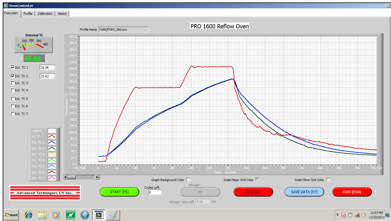
Figure 3: Reflow Cycle 1